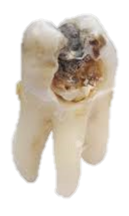
Decayed Missing Filled