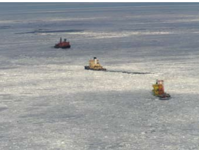
ABOVE. IODP Arctic coring expedition.