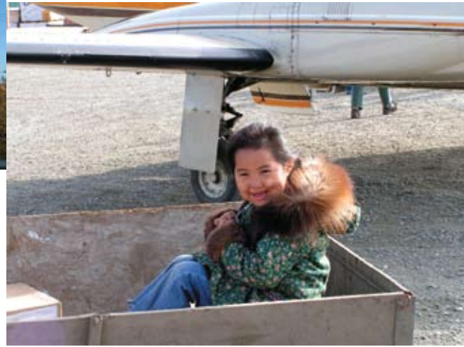
RIGHT. Kivalina resident.

chain to include humans, their communities, and social and economic impacts. Protocols for jointly considering the scientific proposals to the two organizations, as well as coordinated planning efforts and data sharing protocols assure coordinated research.