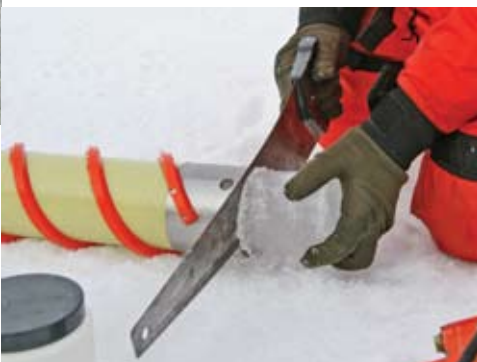
RIGHT. Ice coring.