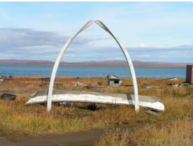
Bowhead whale jawbone arch in Kivalina, Alaska.