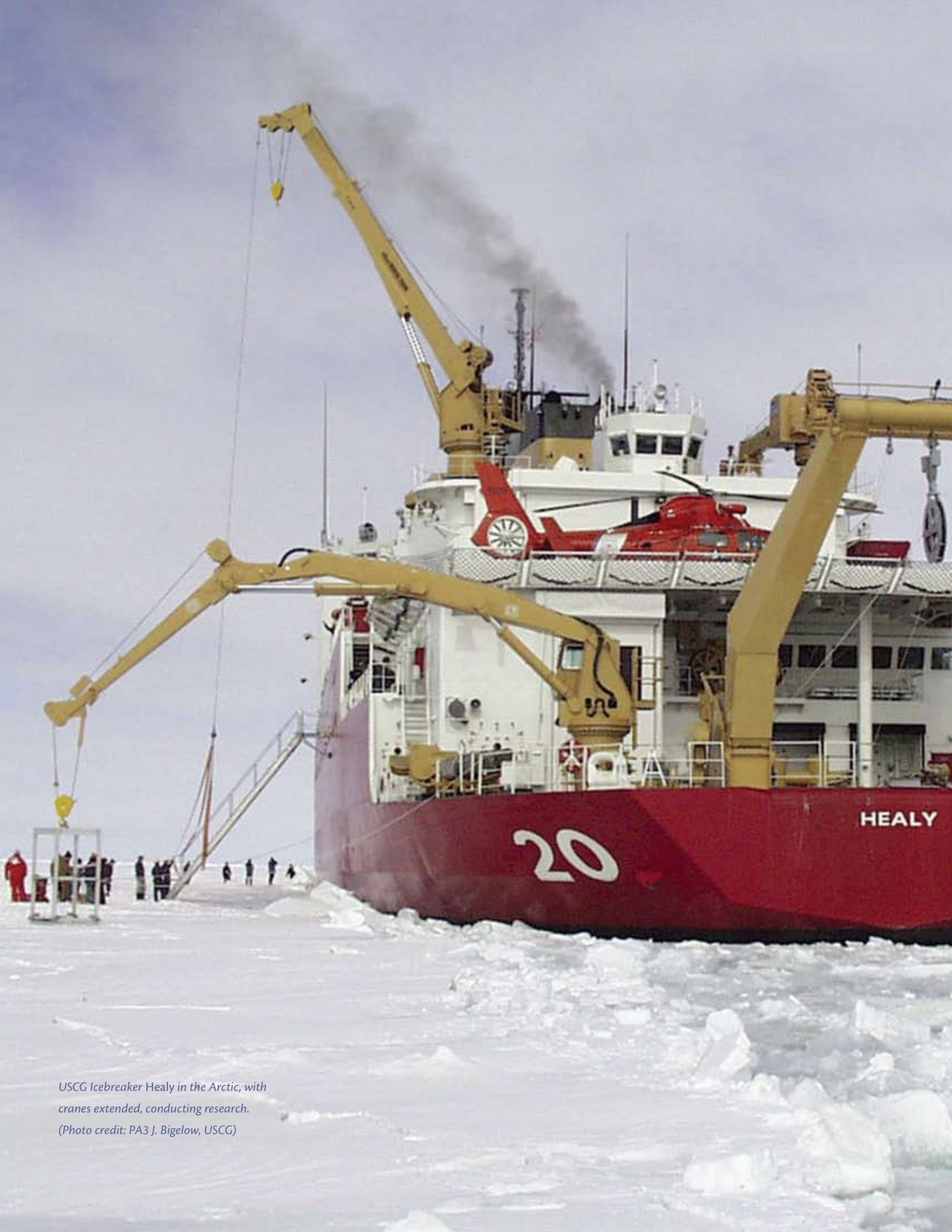
USCG Icebreaker Healy in the Arctic, with cranes extended, conducting research.