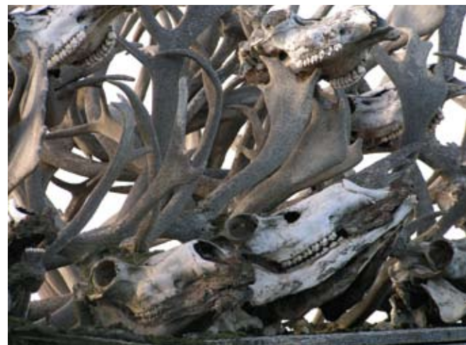
Caribou trophies.

OBSERVING. Activities include: data rescue; improving observation density, collocation, and integration; improving coverage to close observation gaps; developing optimal observation and sampling strategies; observing key processes and studying feedbacks; acquiring paleoclimate and paleoenvironmental data over critical time periods; developing networks; developing data archival and distribution systems; and using innovative technologies.