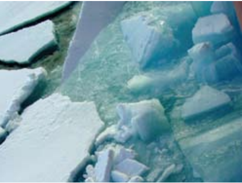
LEFT. Growlers.