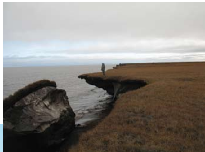
ABOVE. Coastal erosion.

The Commission has engaged in constructive dialogue with many players, and concludes that an oil spill research agenda would be relatively easy to put together if funding for research is made available (see white paper on this topic at http://www.arctic.gov ). Participants that would be involved in such a program include USCG, NOAA, NSSI, MMS, OSRI, NOAA, DOT’s Office of Pipeline Safety, and the State of Alaska.