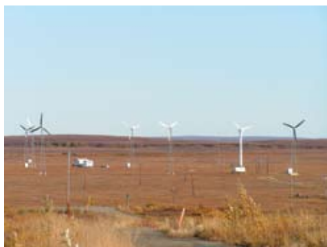
LEFT. Wind power near Kotzebue.