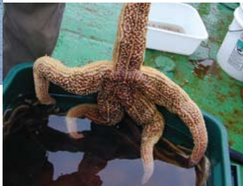
RIGHT. Bering Strait starfish.