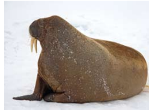
Pacific walrus.