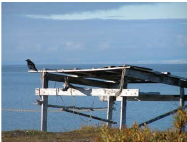
LEFT. Fish drying rack on Kotzebue Sound.

USARC strongly urges an immediate appropriation of funding to NOAA’s Arctic and Ocean Exploration programs, including a line item for the RUSALCA program, to honor the MOU between the governments of Russia and the United States, through NOAA. Failure to regularly fund the American contribution to this joint research effort jeopardizes future access to Russian territorial waters and opportunities to share sampling platforms. Elsewhere in this report, the Commission recommends further work to strengthen US-Russian cooperation in Arctic research.