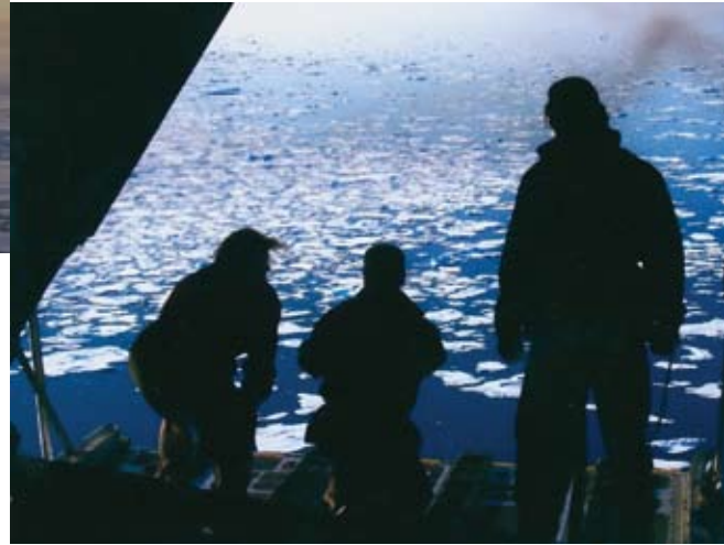
RIGHT. Surveying sea ice conditions.