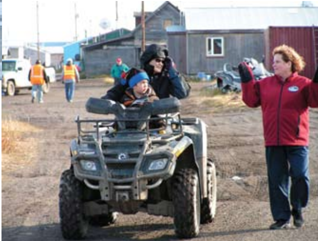
RIGHT. Exploring Kivalina.