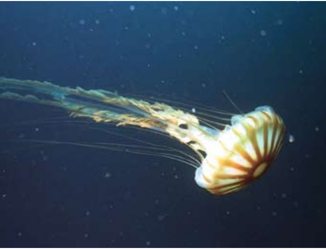
LEFT. Chryasora melanaster .