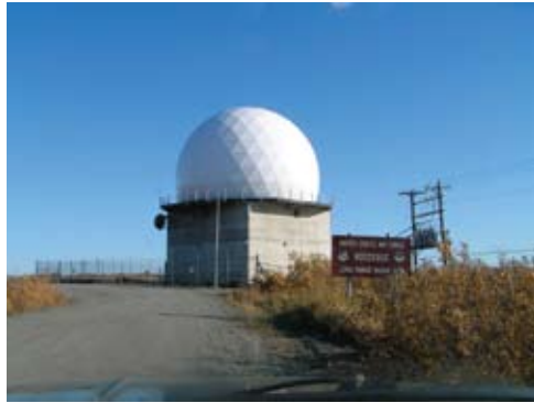
ABOVE. US Airforce Long Range Radar Site near Kotzebue.