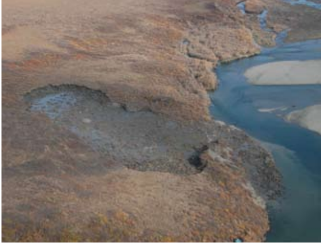
Retrogressive thaw slump.