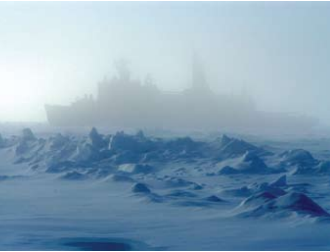
LEFT. Nuclear icebreaker in the fog. BELOW. Launching a mooring.