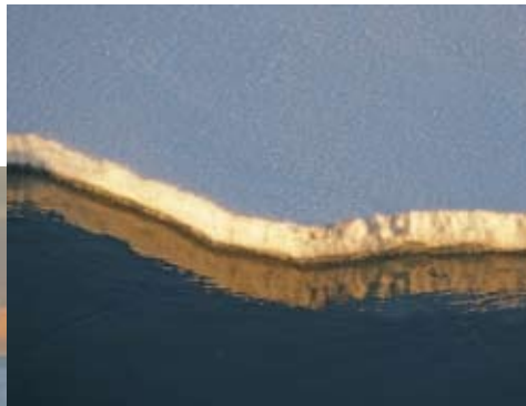
ABOVE. Ice-edge.