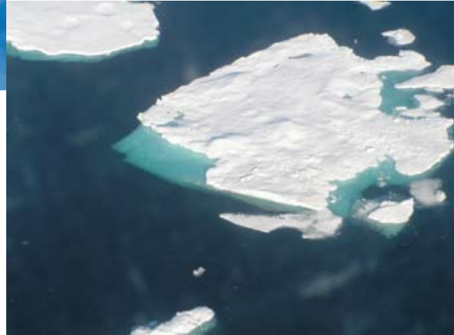
BELOW. Sea ice.

programs. It is also critical to engage the private sector, which has commercial interests in the nature of Arctic change, for example, through policy forums and funded research avenues (e.g., Small Business Innovation Research).