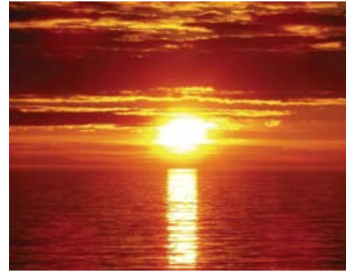
Arctic sun.