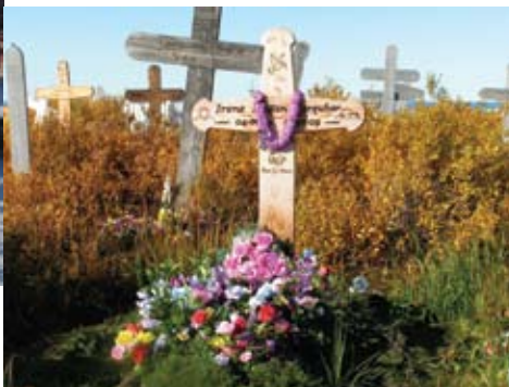
BELOW. Kotzebue graveyard.