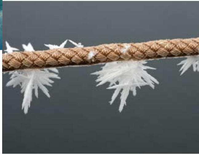
BELOW. Ice crystals.