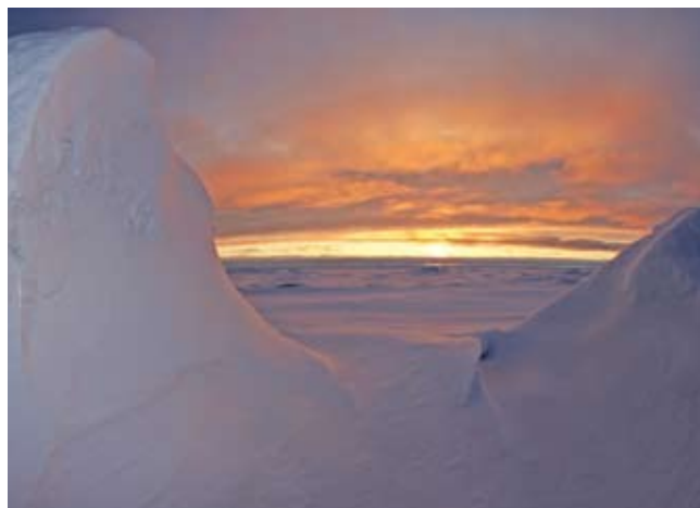
Arctic ice valley sunset.