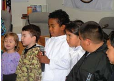
ABOVE. Nikaitchuat IIsagvik school children singing Inupiaq songs in Kotzebue, Alaska. RIGHT. Life is good.