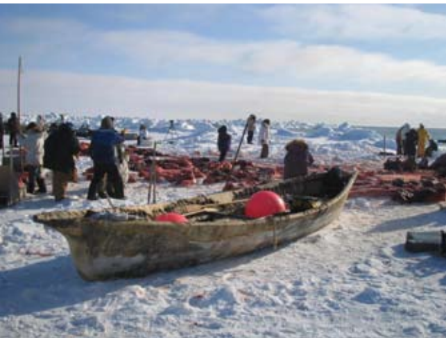
LEFT. After the hunt.