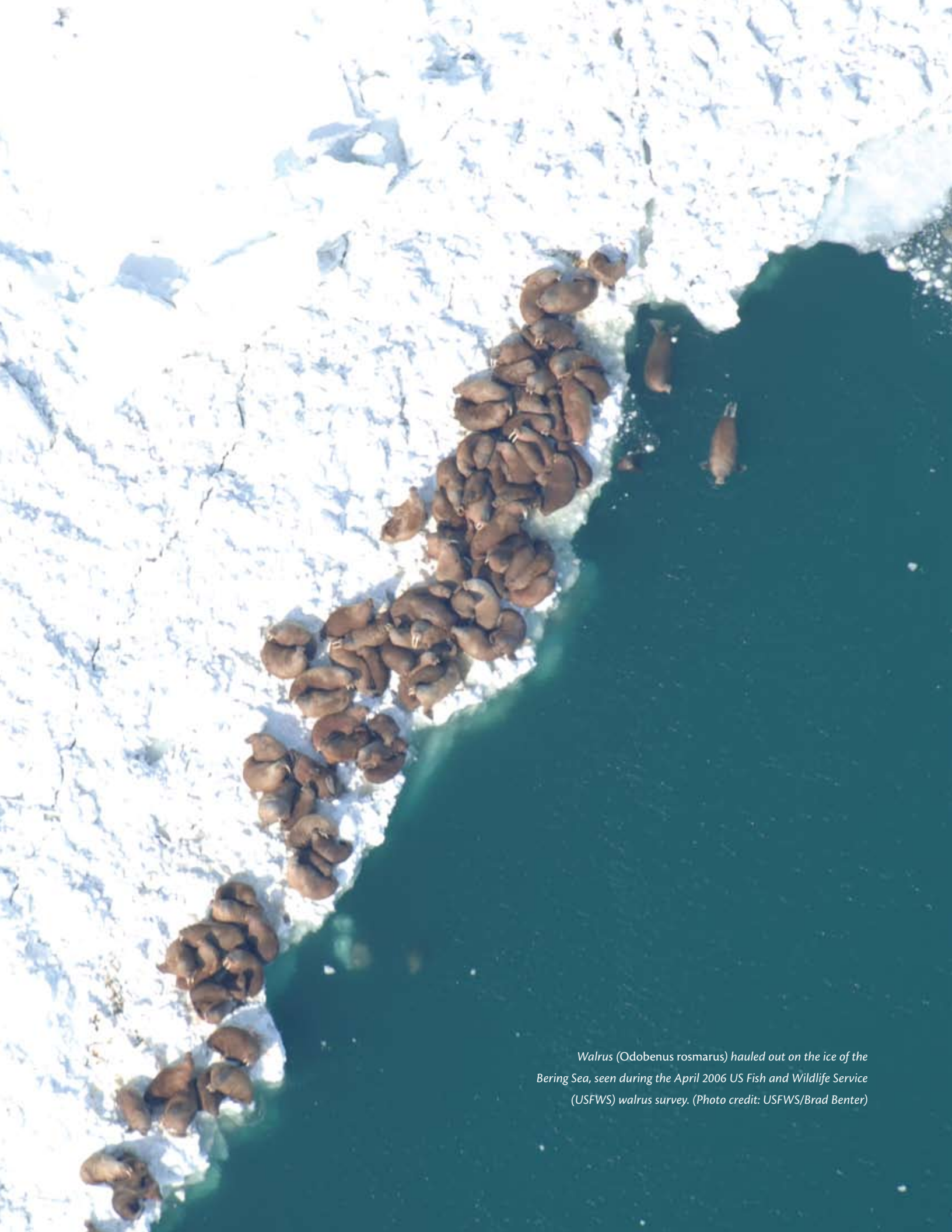
Walrus (Odobenus rosmarus) hauled out on the ice of the Bering Sea, seen during the April 2006 US Fish and Wildlife Service (USFWS) walrus survey.