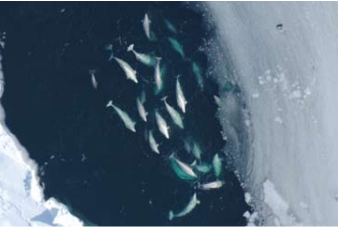
LEFT. Belugas in the Bering Sea seen during the April 2006 US Fish and Wildlife Service (USFWS) walrus survey. BELOW. Drilling through ice.