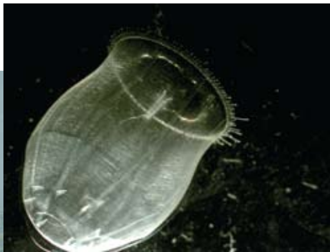
ABOVE. Aglantha .