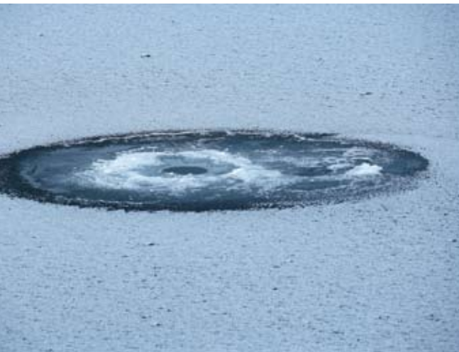
ABOVE. Seal hole.