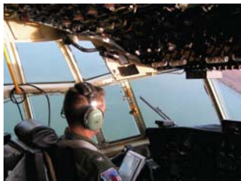
BELOW. Piloting C-130.