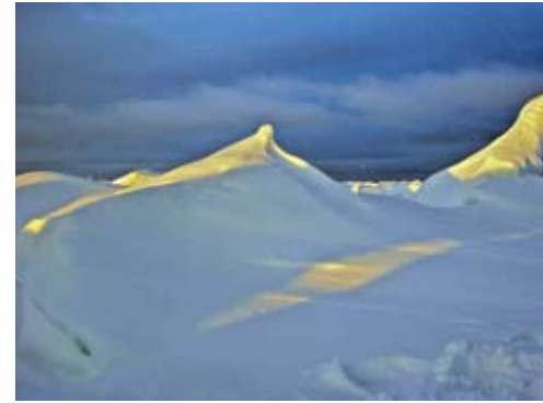
Ridge peaks in the late-day sun.