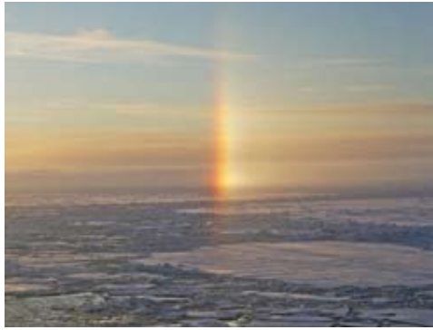
ABOVE. Sun dog.