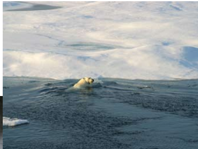
ABOVE. Polar bear.