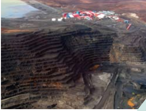
Red Dog Mine.