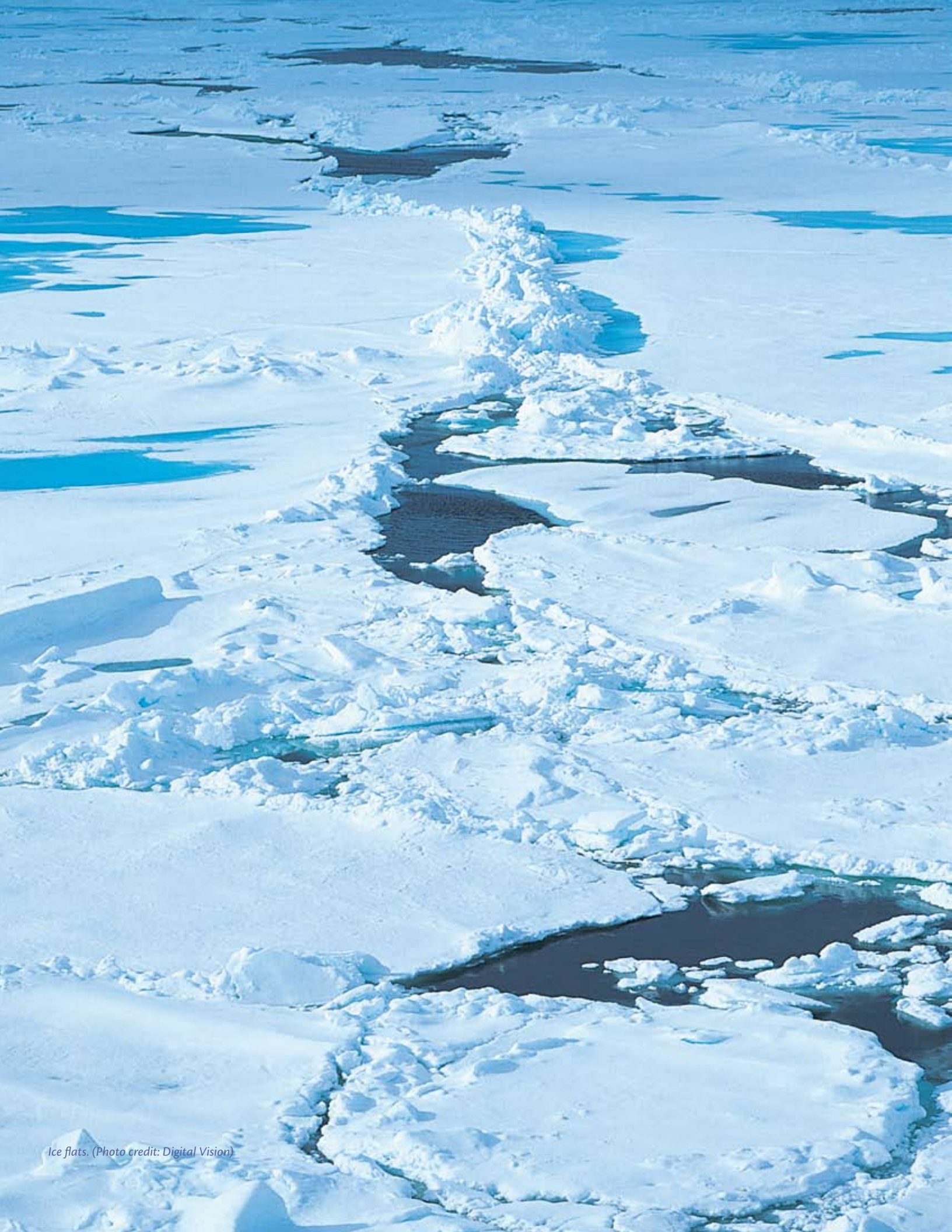
Ice flats.