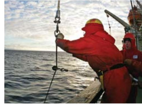
Last mooring.