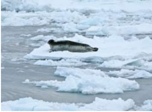
ABOVE. Bearded Seal.