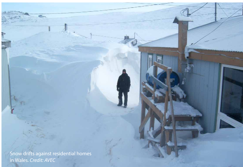
Snow drifts against residential homes in Wales.