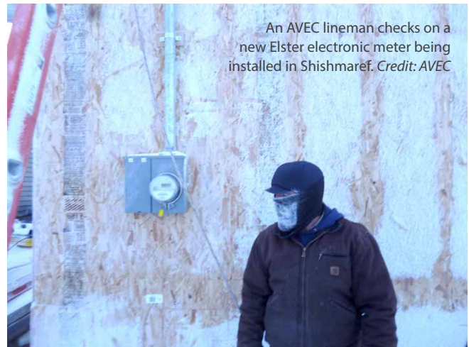
An AVEC lineman checks on a new Elster electronic meter being installed in Shishmaref.

To prioritize research needs that had not yet been addressed by efforts over the previous year and to strategize for implementation of new efforts, workshop participants divided up into separate breakout groups (Data and Technology Research Needs, Socioeconomic Research Needs, and Policy & Collaboration Research Needs) with each group focused on a specific research need category.