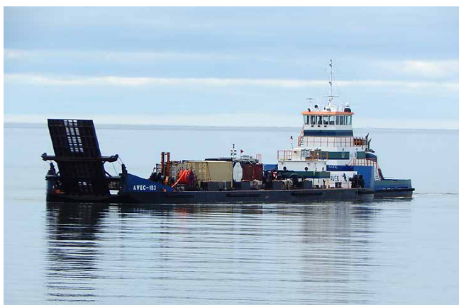
AVEC's tugboat and barge making a fuel delivery in Shaktoolik, Alaska.

Participants in the second workshop included representatives from a wide variety of agencies and institutions (see full list on page 2).