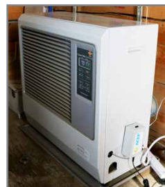
ACEP's PuMA fuel meter installed on residential heating stove.

The Pump Monitoring Apparatus (PuMA) has been developed by the Alaska Center for Energy and Power as a means of obtaining data on real-time diesel fuel oil consumption for individual residents. This device's installation does not require breaking into the fuel system and thus can be mounted by a residential user with basic written instructions. PuMA is able to record consumption over time and transmit the data to a central repository via SMS or MMS (cellular texting). Information and data collected and displayed by this device provides information to homeowners about their residential fuel use, including fuel remaining in the tank. This meter has been pilot tested at a few homes in the Fairbanks area but additional funds are needed to further test, refine and validate the system before it can be deployed and used in remote communities.