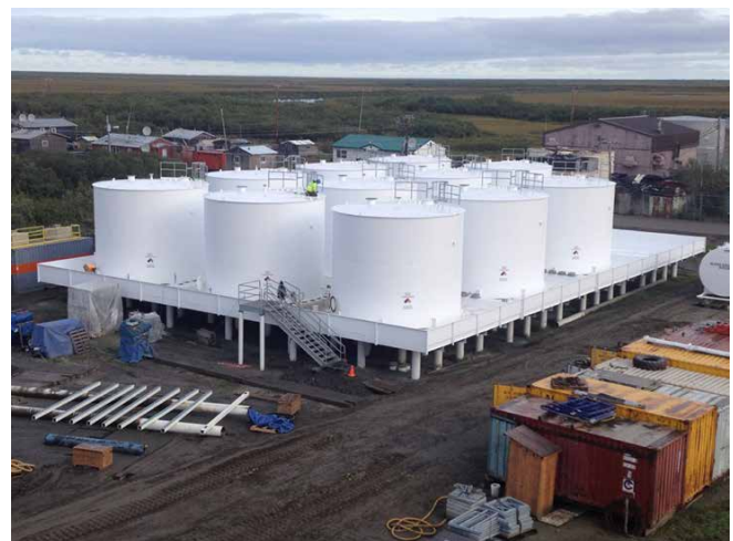
Bulk Fuel Tank Farm in Emmonak, Alaska.