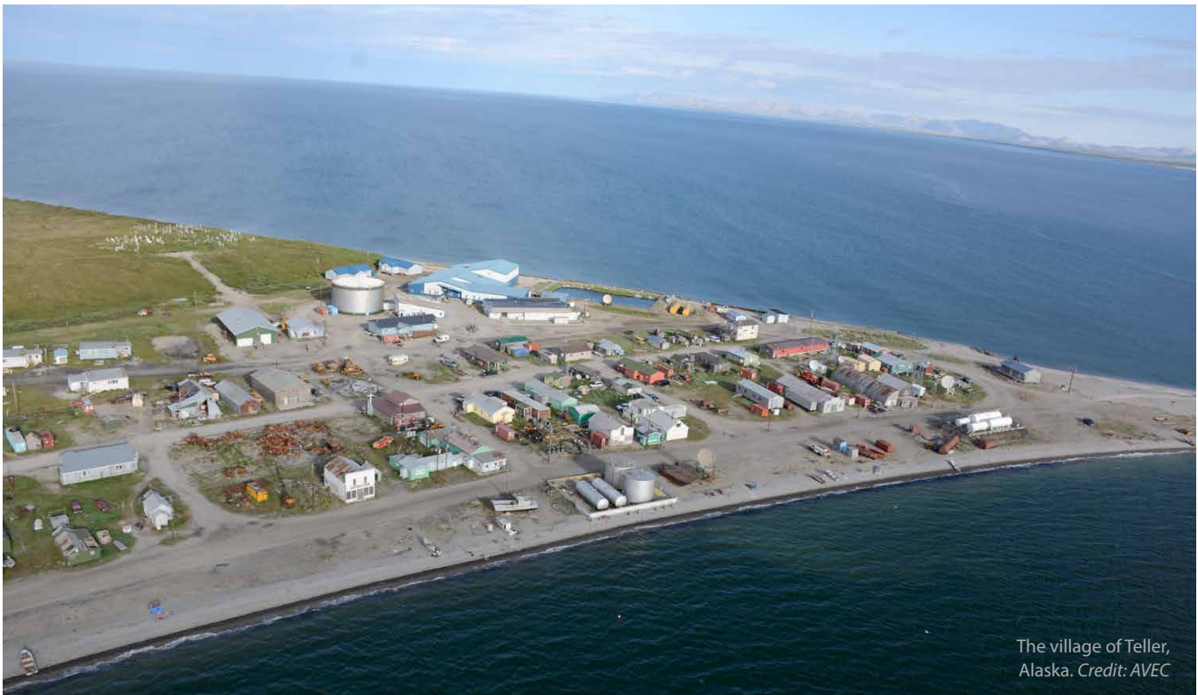
The village of Teller, Alaska.