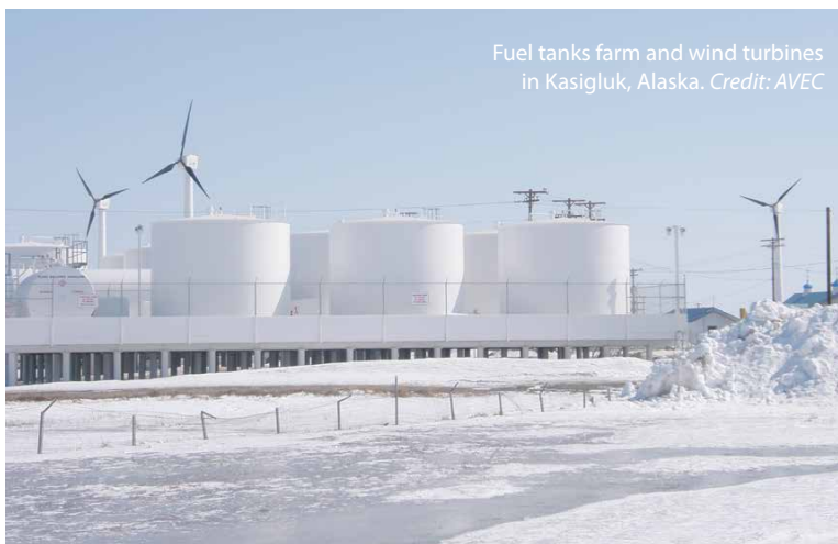
Fuel tanks farm and wind turbines in Kasigluk, Alaska.

Increasing opportunities for public-private partnerships to develop renewable energy and energy efficiency projects and enhance residential heating options was identified as the group's final priority item. The recently released ACEP/AEA report titled "Barriers to and Opportunities for Private Investment in Rural Energy Projects" 13 outlines several approach recommendations. These include the development of a project specification process that would facilitate public-private partnerships for energy projects. The goal of this process would be to reduce the transaction costs (legal fees, permits, loan-closing fees, etc.) associated with project development for the private investor and ease the ability of the private investor to respond to opportunities