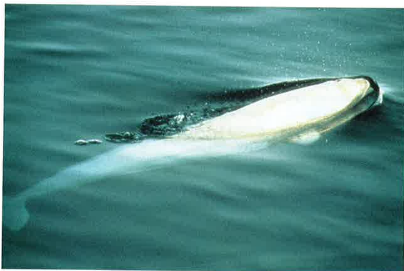
Beluga whale, Beaufort Sea, Alaska.

EPA's Office of Research and Development is supporting a project at Utah State University to conduct a detailed investigation of the reduction of trichloroethane and dichloroethane levels in groundwater by naturally occurring microbial bioremediation techniques.