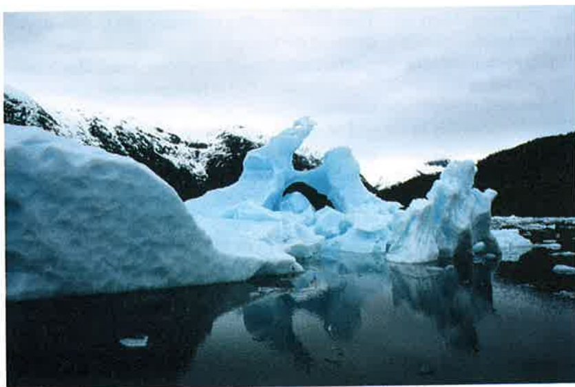
Three-story-high iceberg, LeConte Bay, Alaska.

The decrease in sea ice extent of 2.9% per decade since 1980 is statistically significant. Sea ice