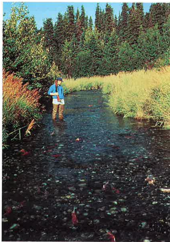
Sockeye salmon spawning in Glacier Flats Creek, Tustumena Lake watershed, Alaska.

A number of agencies support research on archaeology, history, and Native culture (BIA, BLM, USFS, NPS, SI, NSF). Finds of artifacts and bones give evidence of past economies and baseline data for pollution monitoring, and historical and ethnographic descriptions tell of more recent conditions. Coastal resources (fish, seals, walrus, whales) supported the largest human populations in Alaska, and changing shorelines