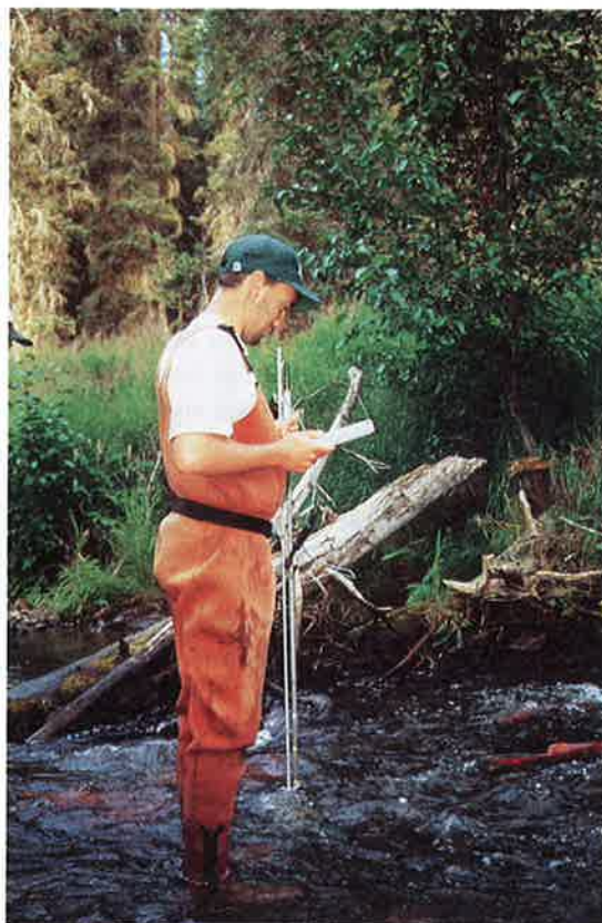
Sockeye salmon habitat preference research, Nikolai Creek, Tustumena Lake watershed, Alaska.

all of the Arctic Council programs, do not operate in a vacuum. Many Arctic problems are components of global, hemispheric, regional, national, or local issues that are being addressed in other forums, and this fact must be taken into account in assessing the potential impacts of contaminants on the Arctic region. Assessment of the effects of climate change in the Arctic, for example, demands close cooperation between AMAP and the Arctic Council's working group on Conservation of Arctic Flora and Fauna, together with the International Arctic Science Committee and the Intergovernmental Panel on Climate Change.