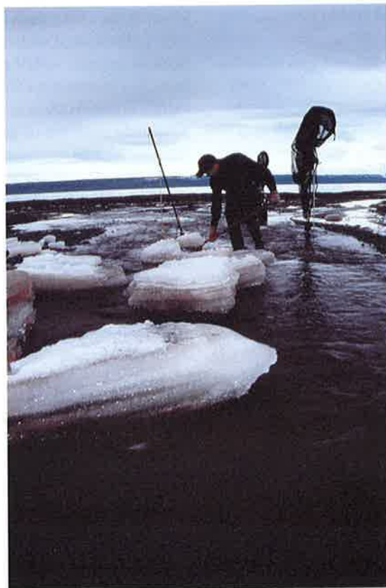
Spring breakup at the Nikolai Creek sockeye salmon research site.

Continental shelves are sensitive to environmental forcing, providing an indication of more widespread changes in the global environment, although the signal-to-noise ratios in these ecosys-