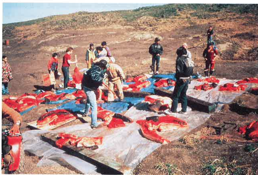
Native subsistence harvest of beluga whales, western Alaska. Tissue samples are collected for AMMTAP by USGS.

resources and human uses of those resources. The program includes measuring pollutants from a nationwide network of 240 sites. Biological effects of contaminants are evaluated on the basis of sediment toxicity assessments, biomarker responses, and changes in benthic community structure. In 1997, sampling was conducted at eight coastal sites in the U.S. Arctic, extending from Nome to Barter Island. This work is important for looking at the distribution and collection of contaminants within the environment and the link to observed effects.