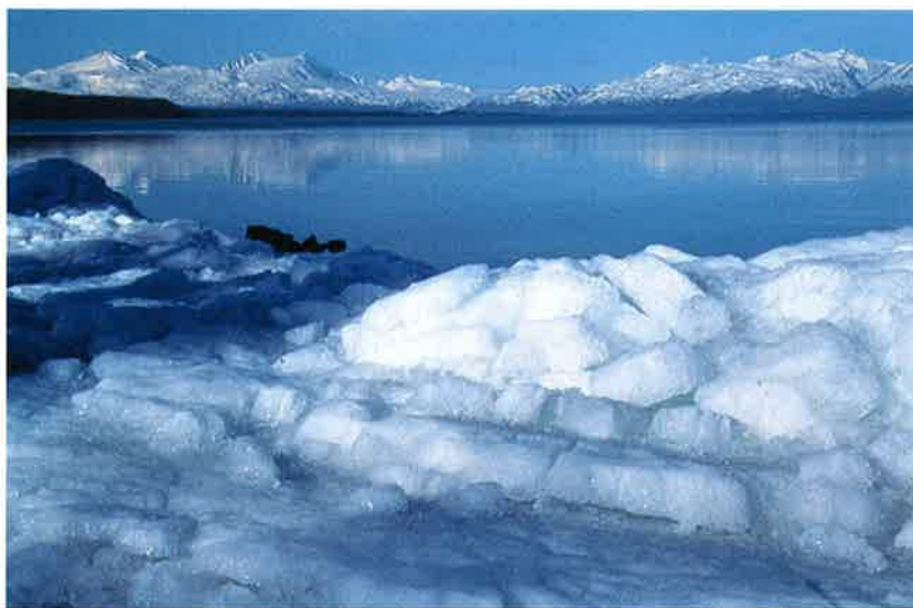
Tustumena Lake, Alaska.

rological conditions in the winter and spring–summer seasons seem to have changed from the 1980s to the later 1990s. The Bering Sea system underwent a major change in 1977, from a cold regime to a warm regime, primarily due to an intensification of the Aleutian Low over the North Pacific Ocean. In the 1990s the low shifted westward, and high pressure set up over Alaska, circulating cold Arctic air over the Bering Sea. Winters have become slightly colder with more ice, and summers warmer with clearer skies.